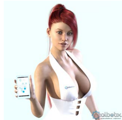
Harmony from Realbox

Appearance is the most customizable part of buying a sex robot. Options include: eye colour, pubic hair (colour and shape), ears (elf or regular), hair, skin colour and makeup. They are of a lifelike height (average around 170cm) but comparatively lightweight with the heaviest being around 70 lbs. On some sex robots the faces can be swapped. Current sex robots, like their sex doll cousins, are made from silicon rubber and are advertised as being “warm to the touch”. These robots are equipped with all over body sensors so that they can respond to touch. And sometimes the response is dependent upon the chosen personality trait of the sex robot.